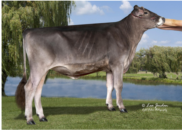
Cutting Edge D Nadine - 8th place Fall Yearling at the 2019 World Dairy Expo.