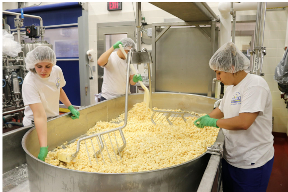
SDSU students making cheese in the Davis Dairy Plant.

All photos have been approved for use in this article.